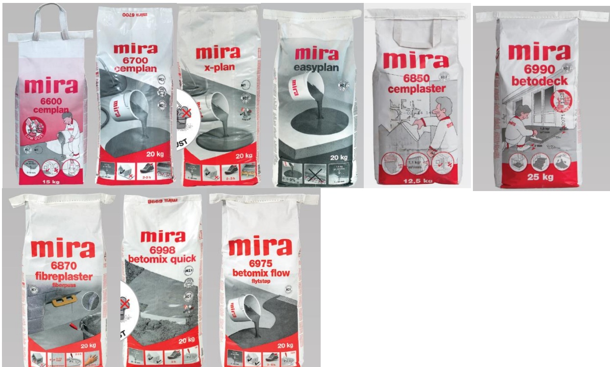
Figure 1: Picture of products