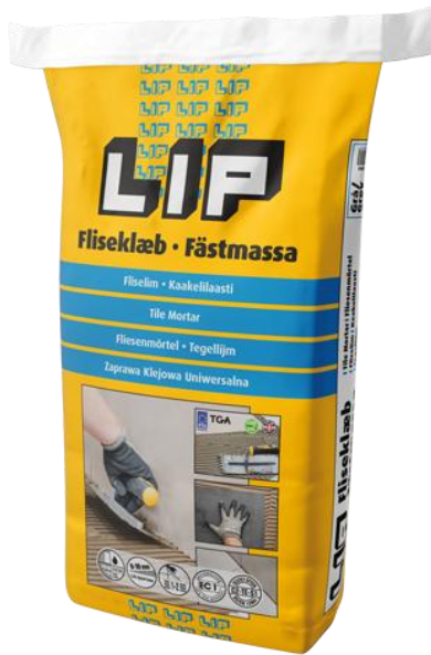
LIP Tile Mortar