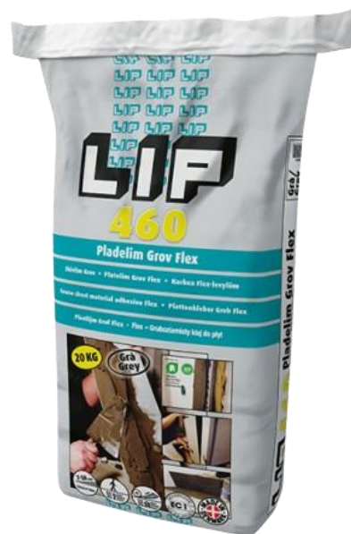
LIP 460 Sheet Adhesive Coarse Flex

UN CPC code: 3733 - Refractory cements, mortars, concretes and similar compositions N.E.C.