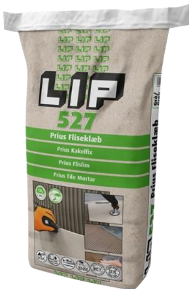
LIP 527 Tile Mortar