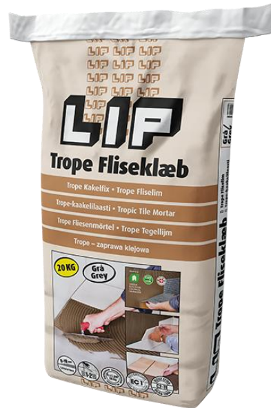
LIP Tropic Tile Mortar - Grey